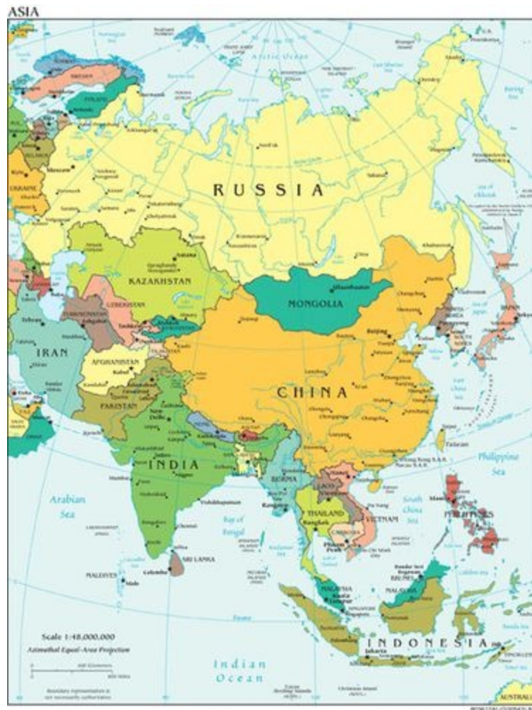
map of Asia

These wild cats have certain traits that help them thrive in these tough environments. They have thick fur that keeps them warm in the cold. This grey-white fur with dark spots is a great camouflage. They have very big paws that help them move around without sinking into snow. Their strong, short front limbs and longer hind limbs help them jump as high as 30 feet into the air! These animals are great predators. They can kill animals that weigh three times more than they do. Their favorite meals include mountain sheep and goats.