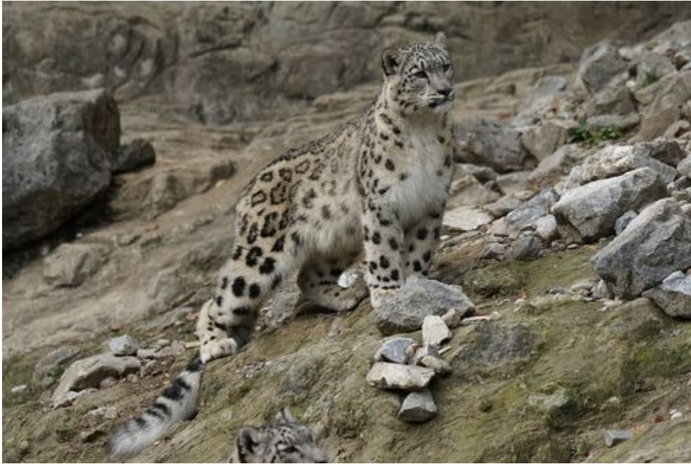
a snow leopard

The snow leopard is a wild cat that lives in 12 countries across central Asia. These countries include Mongolia, India, and Nepal. They live in the high, rugged mountains of these countries.